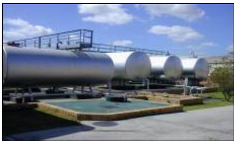
FFS REFINERS, CAPE TOWN