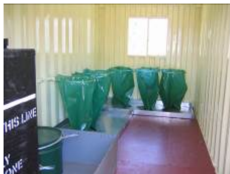
INSIDE CONTAINER WASTE FACILITY

The project was initiated with the assistance of the City of Cape Town, who permitted ROSE to place these containers at some of the Garden Refuse Sites.