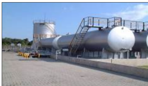
FFS REFINERS, DURBAN