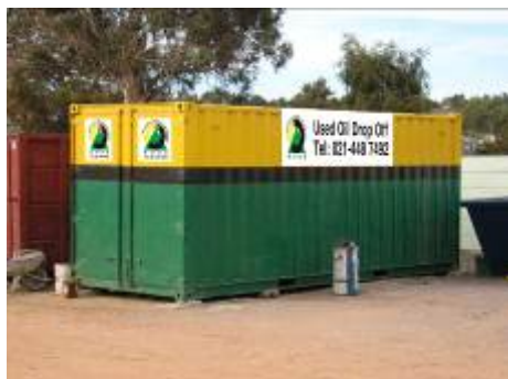
CONTAINER PLACED AT A MUNICIPAL

This project has started off in the Western Cape, placing re-furbished 6 meter shipping containers with facilities inside where the general public can dispose of their used car engine oil, used oil filters and oil soiled containers.