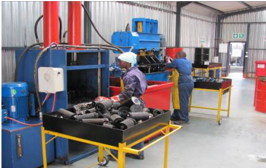
Oil filters being prepared for disposal

As an additional service to their customers, NORA-SA collectors also collect used oil filters for safe disposal. They are paid an incentive by ROSE to subsidise their transport costs.