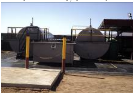
OIL SEPARATION SOLUTIONS BURGERSFORT